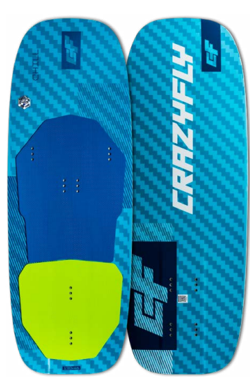
115 x 44 / 130 x 46