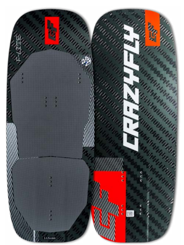
99 x 44 / 115 x 44 / 130 x 46